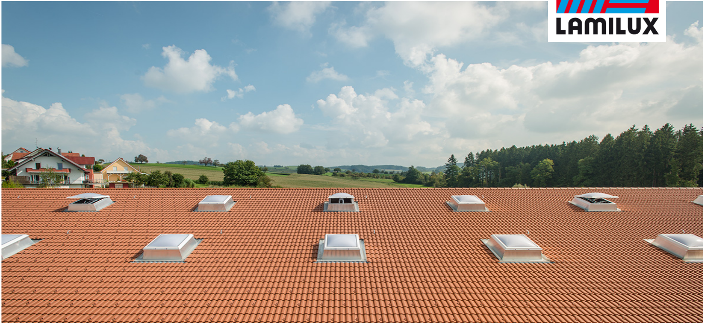
VauDe, Tett nang