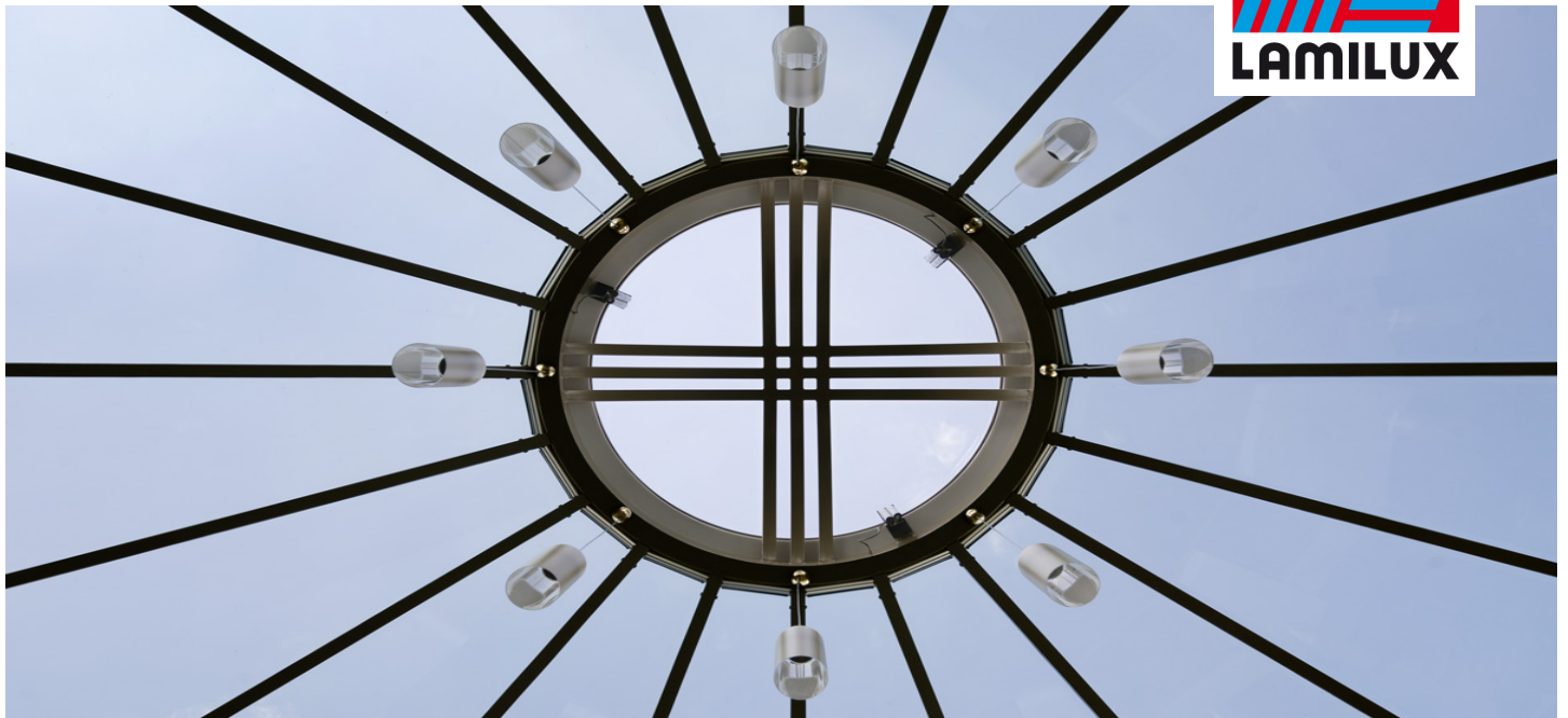
Embassy of Kazakhstan, Berlin