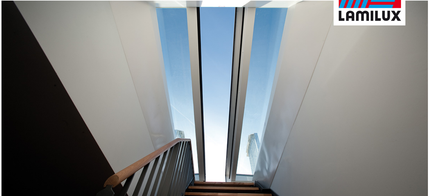
Top floor apartment in the centre of Berlin